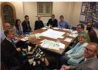
Meeting with the agencies