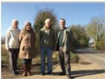
Members of the Flood Action Group

The group was formed in April 2017 and has steadily worked towards making some real progress with some of the issues related to flooding in and around the village. We are a core of local people from Headcorn who act as representatives to reduce flood risk in our area. We hold Multi Agency Meetings to identify key issues & are working in partnership with the agencies & authorities that manage flood risk. (Kent County Council, Southern Water, Environment Agency, Emergency services & National Flood Forum).